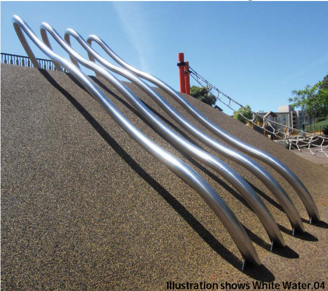
Illustration shows White Water.04