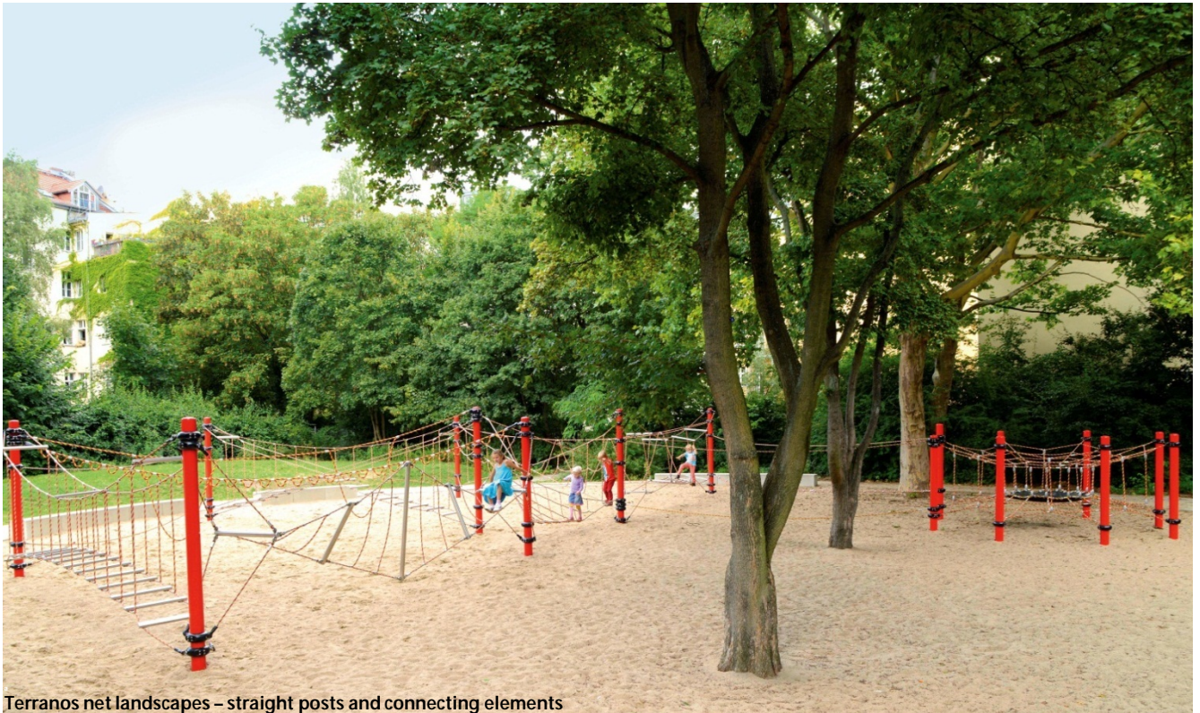
Terranos net landscapes – straight posts and connecting elements

Our netscapes offer children of all ages plenty of space for any kind of climbing, crawling, balancing and other physical activities. The highly accessible components are also the ideal place to get engaged in imaginative play or just hang around and relax.